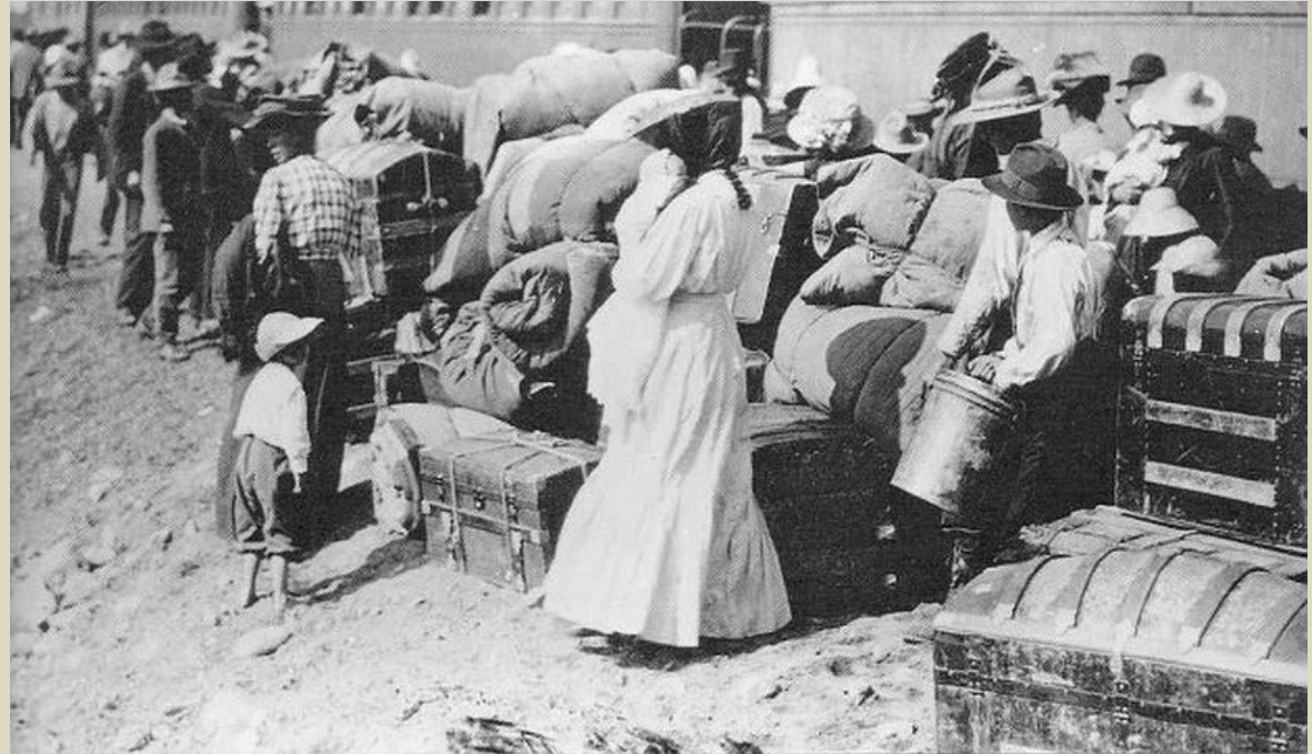
13. Mormons Boarding Train in Pearson to Travel to El Paso