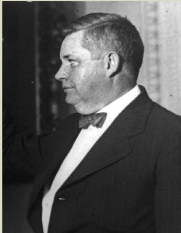
7. Solicitor and Future Church President J. Reuben Clark