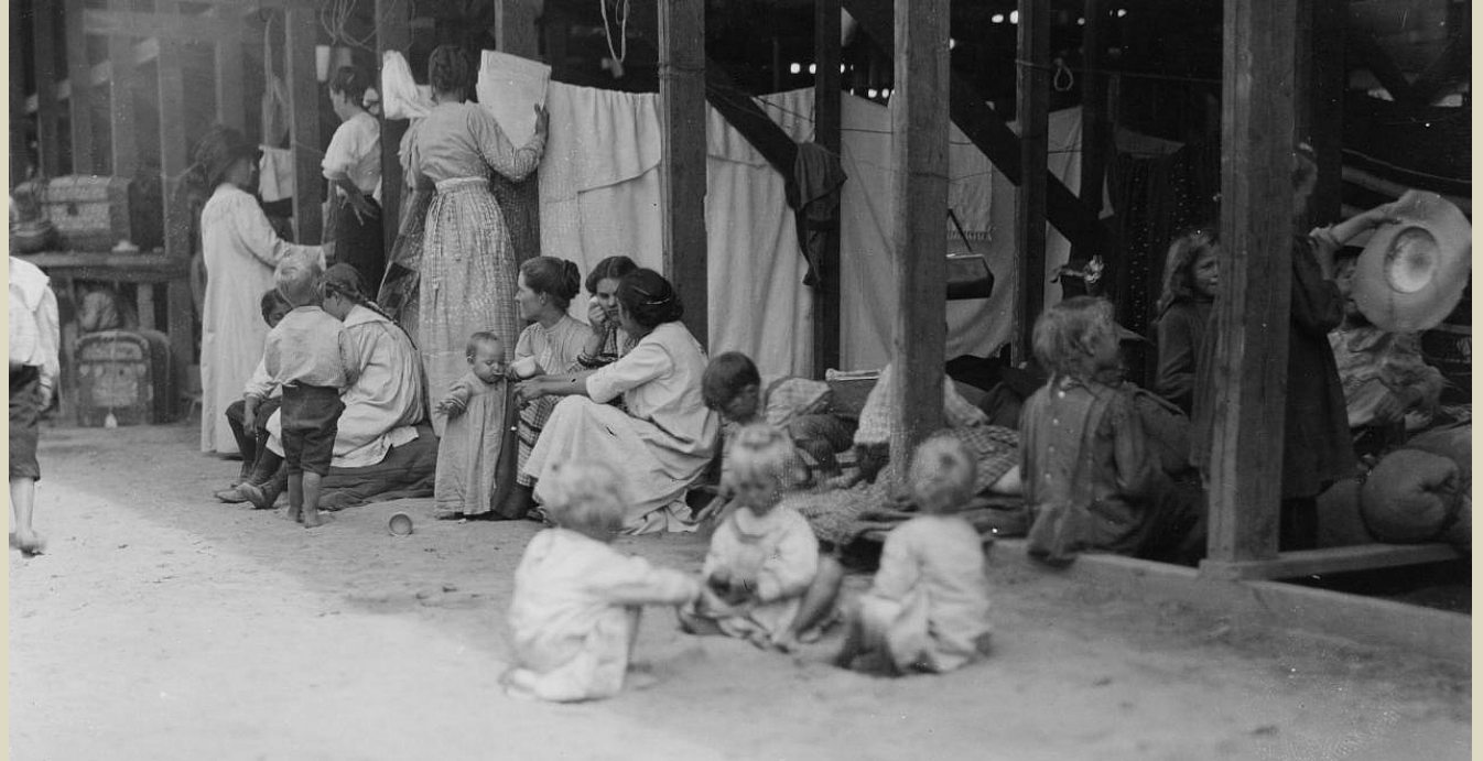
12. Mormon Refugees Living in the El Paso Lumberyard