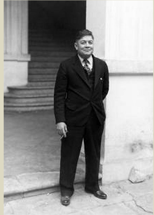
6. Revolutionary General and Governor Rodrigo Quevedo*

*Said to have attended Juarez Stake Academy