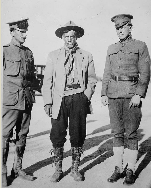
5. Revolutionary General at Fort Bliss in El Paso Maximo Castillo