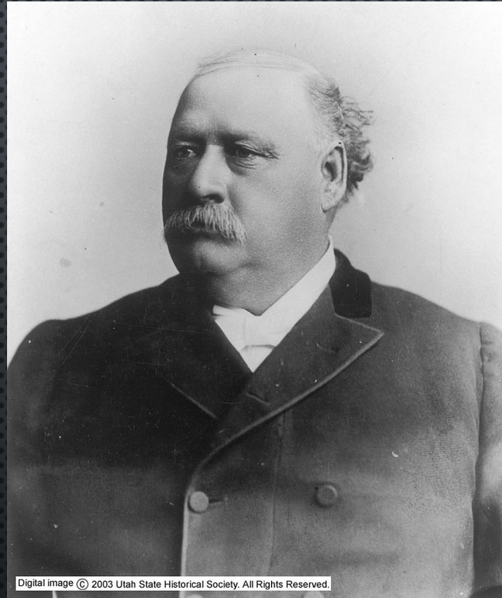
Figure 7: Brigham Young, Jr.