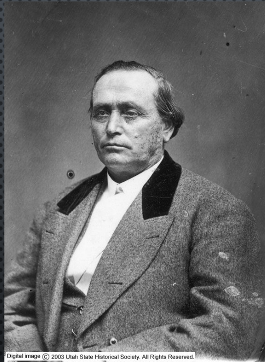
Figure 4: Erastus Snow