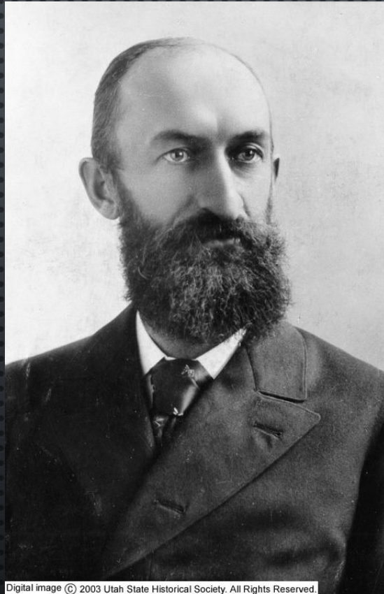
Figure 8: Heber J. Grant