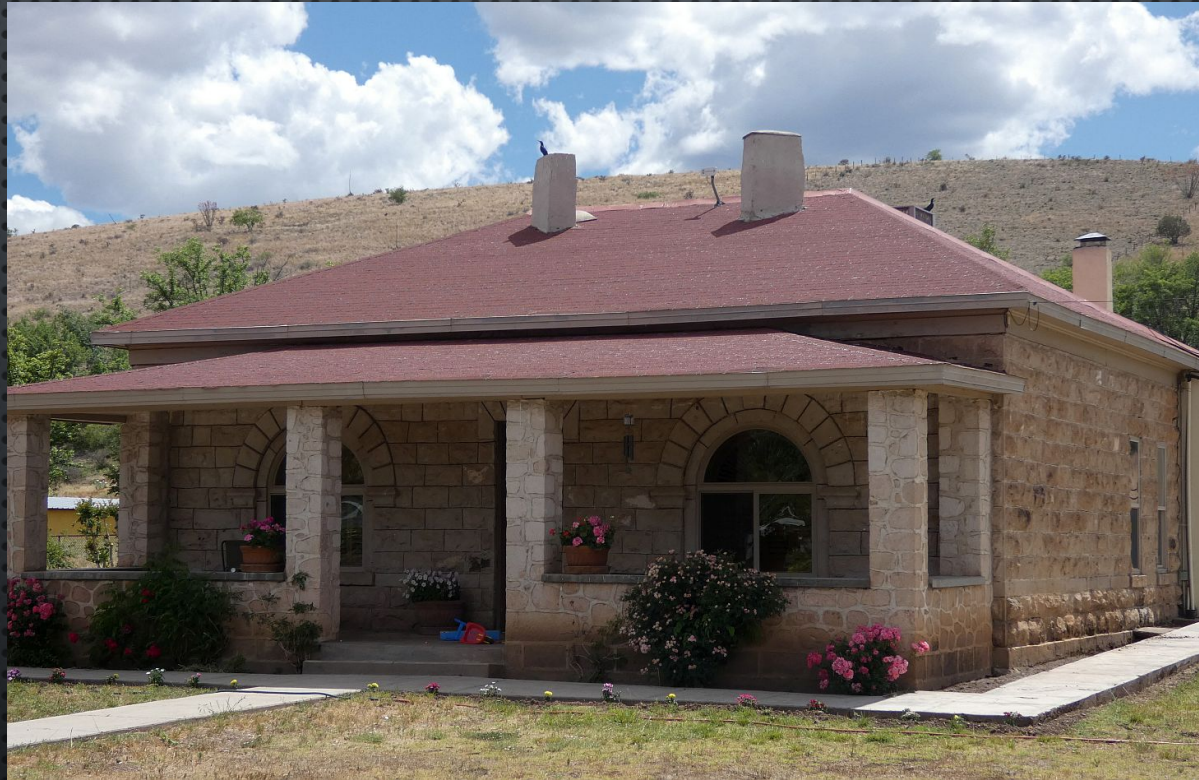
Figure 10: Apostle A. O. and Avery Woodruff Home in Colonia Juarez