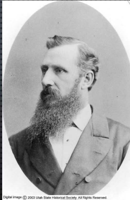
Figure 6: Joseph F. Smith